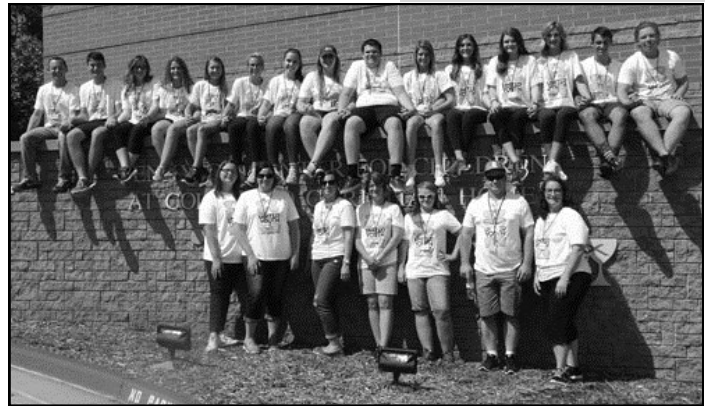
Mission Group, First Christian Church, Duncan, OK

“ It’s a week of practicing your faith in a really intensified environment. ”