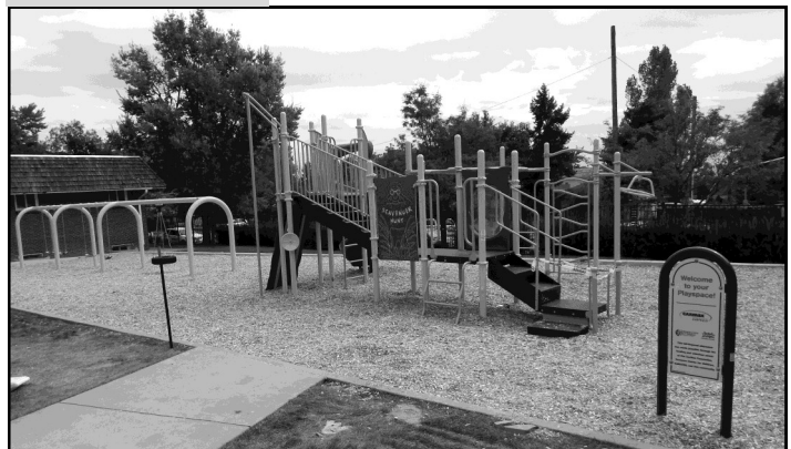
TCC's new playground

We could not have done this without your support and are most grateful for the kids helping design the playground, the volunteers, sponsors and the TCC staff that made this possible. It truly took a village. Thank you to everyone involved!