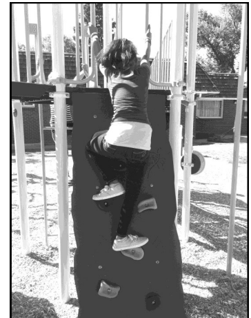
TCC child testing out the new playground

The children at TCC were excited to see the skid steer roll in, remove the old equipment and prep the new playground site. However, since concrete was used to hold the equipment in place and needed three days to cure, the kids couldn't play on the playground for several days. With great pride, the TCC staff watched the kids patiently wait during those three days.