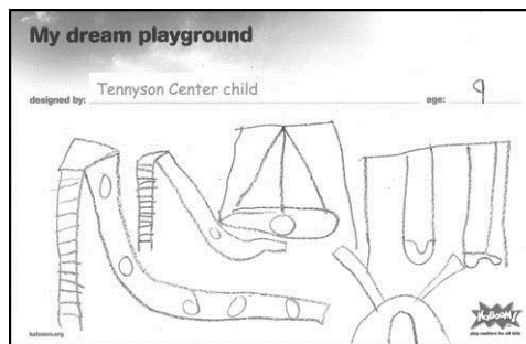
Playground design from TCC play engineer, age 9

The play engineers may not have gotten the shark pit but Tennyson Center for Children's new playground does have a zip line, a tire swing and other sensory-integrated equipment to provide opportunities for the kids to play and heal.