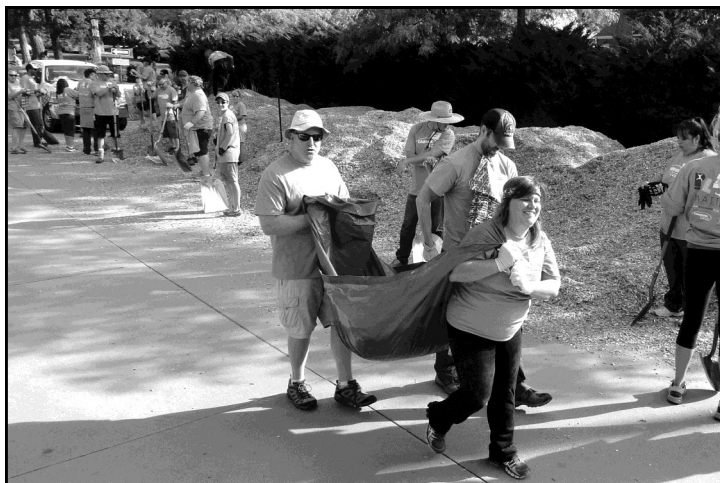
Volunteers moving wood chips