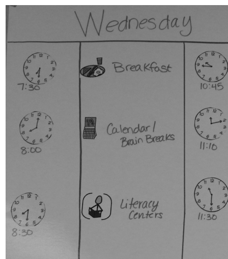
Sample daily routine in ASPEN classroom

We are in the process of opening our third ASPEN classroom. We are seeking a special education teacher and Youth Treatment Counselors. The classroom will be opening soon to additional students. To learn more about ASPEN, contact our Admissions department at 303.433.1232 or admissions@tennysoncenter.org .