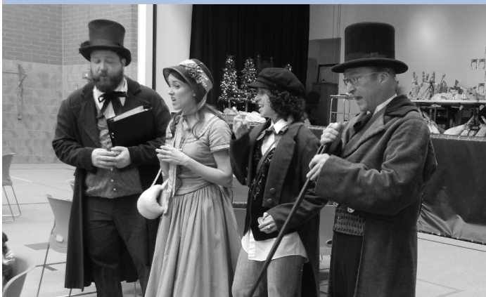
Holiday Carolers at Amp the Cause Holiday Celebration

Help the Kids - Buy a Raffle Ticket Amp the Cause's Board of Directors are raffling off a 2016 Ford Escape to help Colorado nonprofits raise money. A Million For What Matters enables nonprofits, including Tennyson Center, to sell raffle tickets from now until May 28, receiving 100% of the funds from ticket sales (minus credit card processing fees-just $0.59 per raffle ticket). The 2016 Ford Escape will be awarded at the annual Denver Day of Rock on May 28. Visit www.amillionmatters.com to purchase your raffle ticket and help the kids.