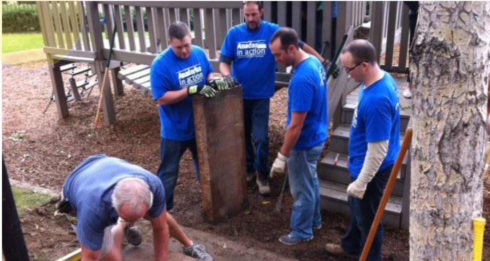
Above: Employees from Anadarko build a series of playground steps from large flagstone slabs. Below: AIMCO staff members prepare the grill for an outdoor BBQ with the kids on a warm spring day.

Without the help of our corporate sponsors, much of our work would be impossible. A large portion of our volunteer base comes from the staff of local businesses and corporations as well as other non-profit organizations who donate their time to help with a variety of activities, including event planning and sponsorship, cottage sprucing and renovation and campus improvements. The photos on the next two pages represent just a small percentage of all of the dedicated businesses and organizations that have so generously involved their staff with the mission of Tennyson Center for Children.