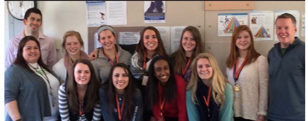
For several years, student volunteers (above and below) from Regis Jesuit High School have dedicated countless hours volunteering at TCC as part of their community service requirements.