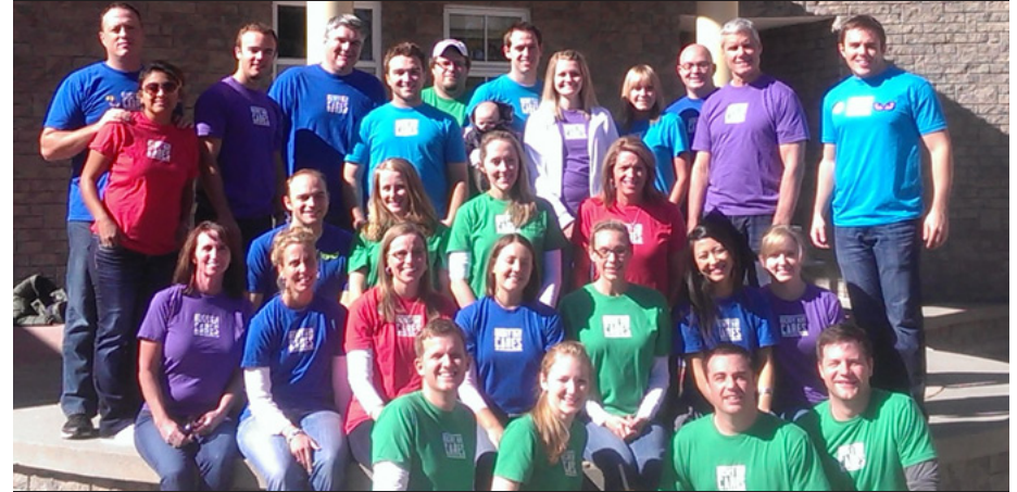
Below: ConAgra employees collect hundreds of cans of food for the kids in our care.