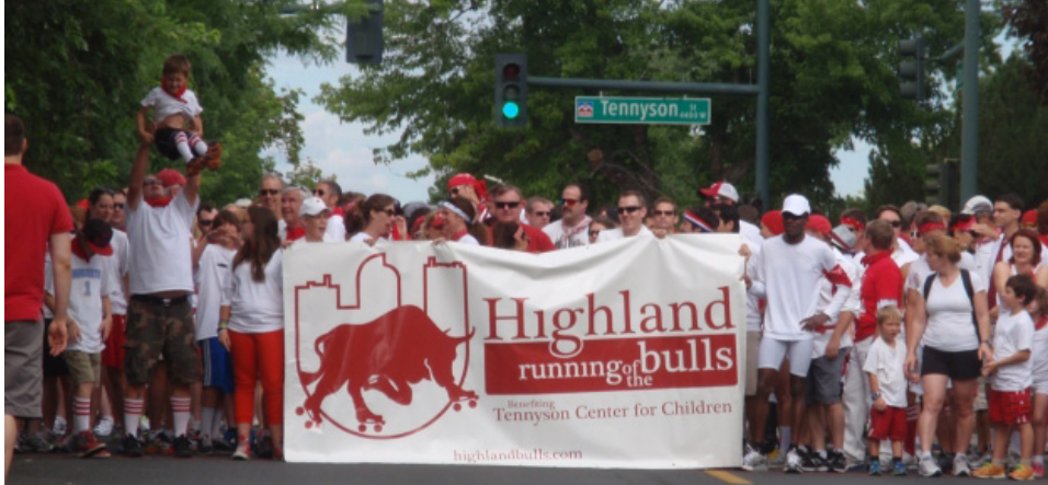
2013 marked the third year of the Highland Running of the Bulls, where the Rocky Mountain Roller Gals play the part of the "bulls" as they chase runners down 32nd Avenue in Denver's Highlands neighborhood.

A third-party event is a fundraising activity that benefits Tennyson Center for Children but is created, coordinated and executed by individuals, businesses or organizations independent from TCC. These wonderful events have grown in popularity and frequency over the years. We are grateful to all the people who have contributed to the success of these events in 2013.