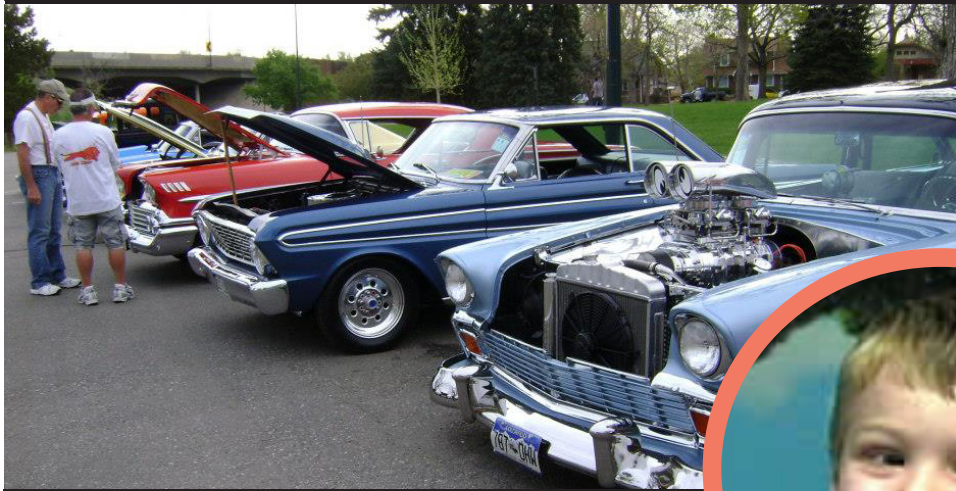
Above: The Northsiders of Denver host an annual summer car show to benefit Tennyson Center for Children. Below: Every April during Child Abuse Prevention month, Happy Cakes Bakeshop features cupcakes that have been named by the kids at Tennyson Center with proceeds from sales donated back to TCC.